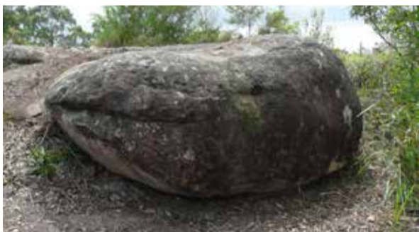
The Spirit Whale - created by the elements of nature and time.